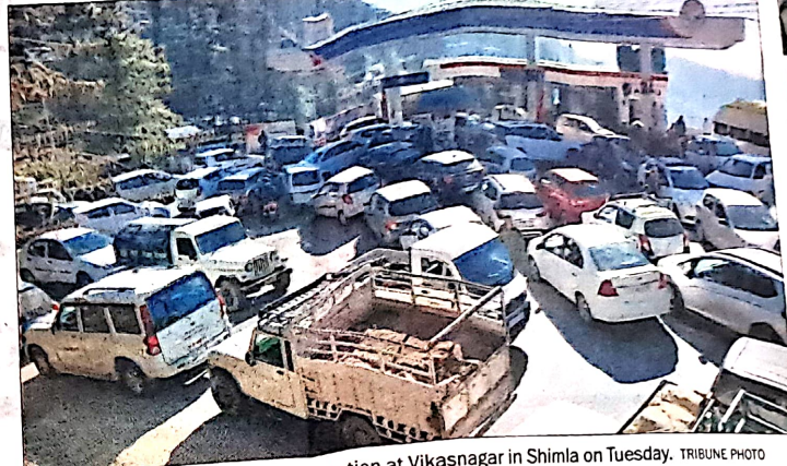
A huge rush of vehicles at a petrol station at Vikasnagar in Shimla on Tuesday.

"We are expecting the situation to improve considerably from tomorrow, as the availability of fuel improves," said an official of the Food and Civil Supplies Corporation. There are around 700 petrol stations in the state and around 80 per cent of them have exhausted their stocks, according to fuel dealers.